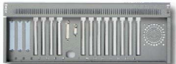
8+4-Slot back panel window for FullSize-AT boards