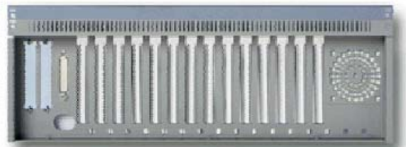
14-Slot back panel window for passive backplane