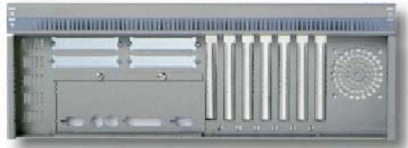
ATX-Slot back panel window for Standard-ATX boards We can offer a lot of special ATX I/O windows